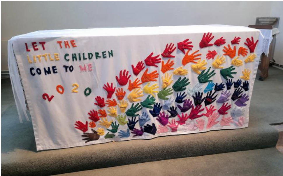
Members visited St Peter and St Paul, Lingfield as part of the Autumn church tour