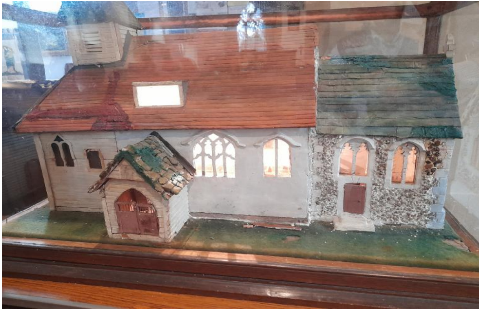
Members visited St Mary the Virgin, Horne as part of the Autumn church tour and saw this model of the early church