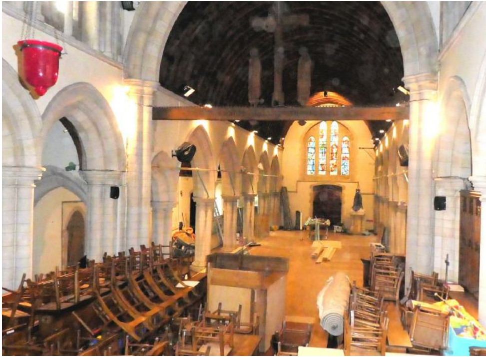
The Trust gave a grant to All Saints, Woodham to support their under floor heating project