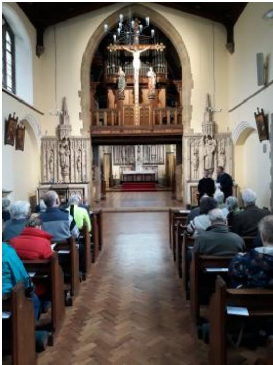
Members also visited St Augustine's Abbey on the Tour