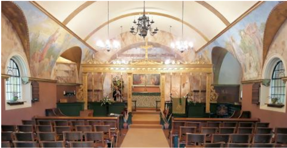
Members visited St Martin's Church, Blackheath on the October church tour and admired the extensive wall paintings